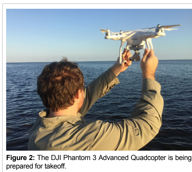
Figure 2: The DJI Phantom 3 Advanced Quadcopter is being prepared for takeoff.

Coastal scientists use several dyes for water tracer studies, especially fluorescein, potassium permanganate, and rhodamine, but fluorescein dye is the only one that