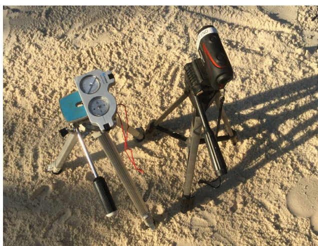
Figure 1: The Nikon Prostaff 7 Laser Rangefinder and Steren Electronics compass are mounted on photographic tripods to measure the speed and path of a rip current, respectively.

Rip float experiments (e.g., using human drifters) have been conducted in Australia, wherein a person floating freely in the rip current is tracked by theodolites [8] or more recently GPS technology. Lagrangian methods of measuring rip currents have recently become popular [9,10]. These methods such as GPS-instrumented drifters have the advantage of less set-up time, safer deployment, more mobility and can capture the path of the rip current. GPS drifters have been extensively used by MacMahan, et al. [11] to measure rip current velocity at beaches in California, France and Australia. Generally, five or more GPS drifters are released in a rip current and tracked in real-time by observers on the beach using laptop computers. Real-time differential GPS drifters have an accuracy less than 1 meter after carrier phase post-processing [12]. Non-differential GPS units, which are an order of magnitude less expensive, are now being used to study rip currents with much success [13].